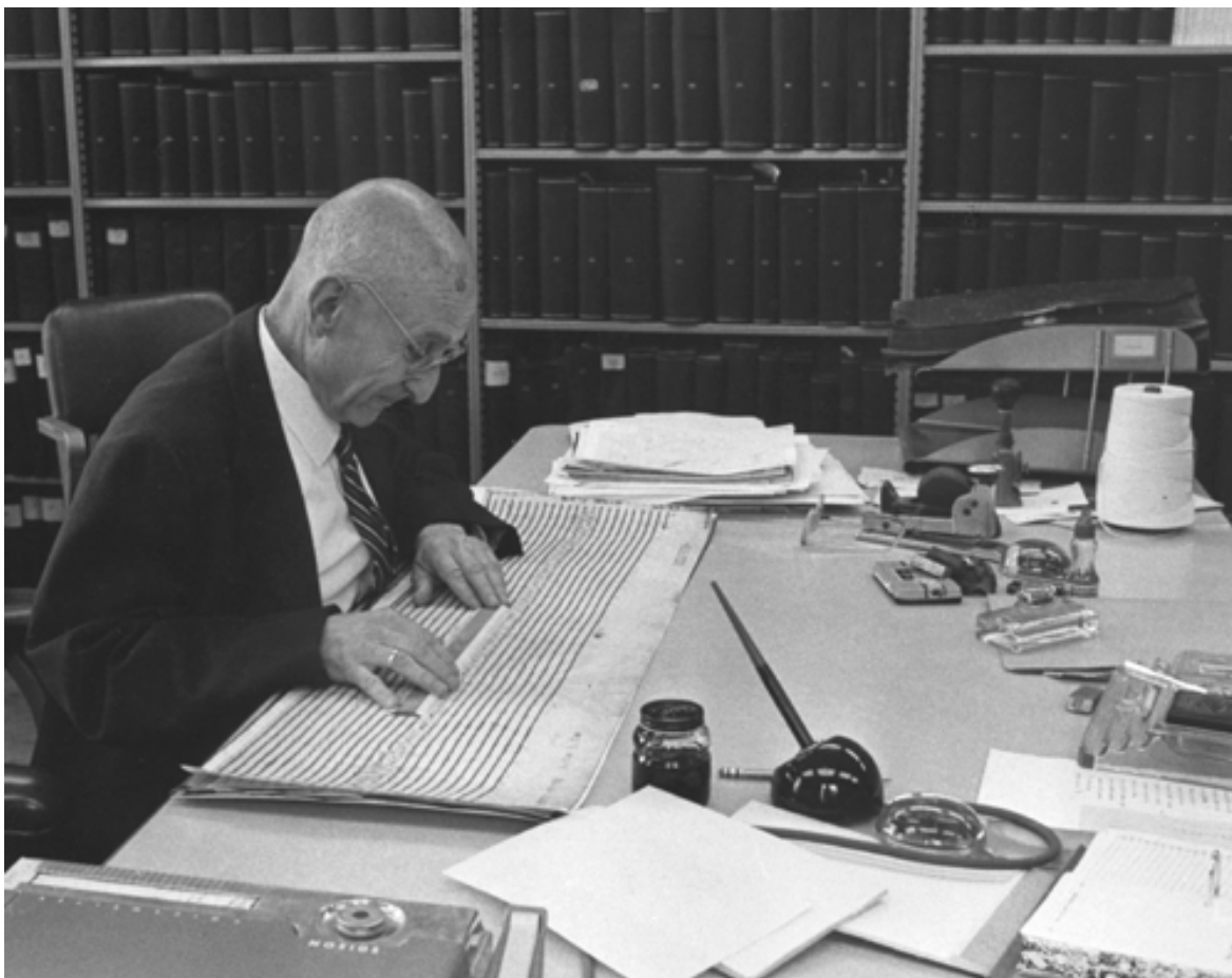
Fig. 3. Beno Gutenberg at work, 1958. German-born and Göttingen-trained, Gutenberg brought to Caltech the European tradition of viewing seismology as a research tool. He also played a major role in extending Richter's instrumental magnitude scale to earthquakes anywhere.