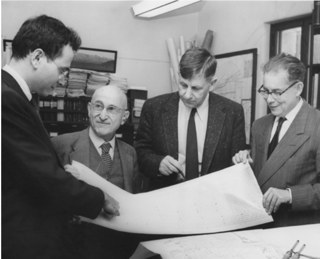
Fig. 2. The stars of the Seismological Laboratory, 1956. Left to right: Frank Press, Beno Gutenberg, Hugo Benioff, Charles Richter.

engineers behind these men, was an extraordinary thing. At Lamont, it was all hustling for government money. But at that time, Caltech had a basic core support that it could depend on, so that there wasn't a single government dollar coming in that would affect their standards.