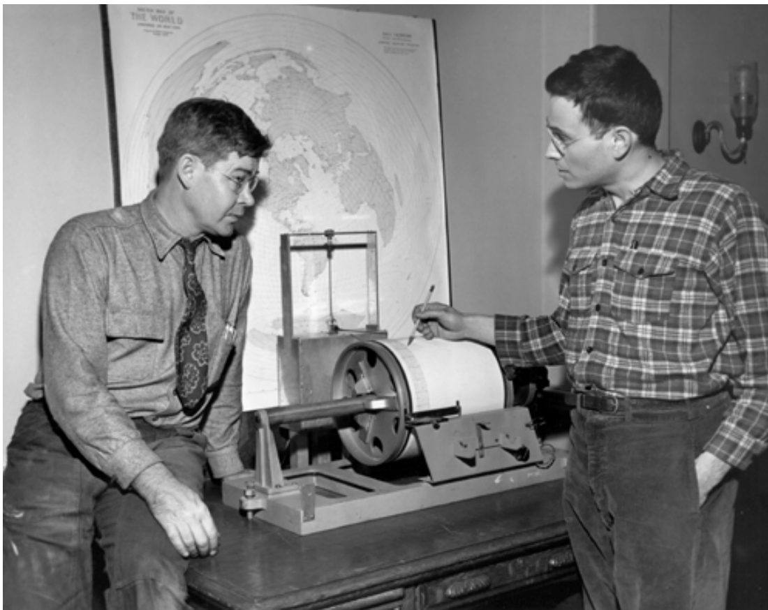
Fig. 1. Maurice Ewing ( left) and Frank Press at the Lamont Geological Observatory, spring 1950, shortly after Ewing's research group moved from Columbia University's Manhattan campus to Palisades, New York.