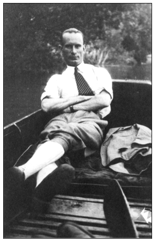
Lounging in a punt in Cambridge, England during the summer of 1932.